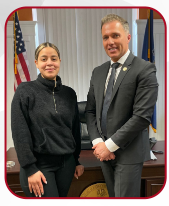
I have a wonderful staff that is always ready to assist you!